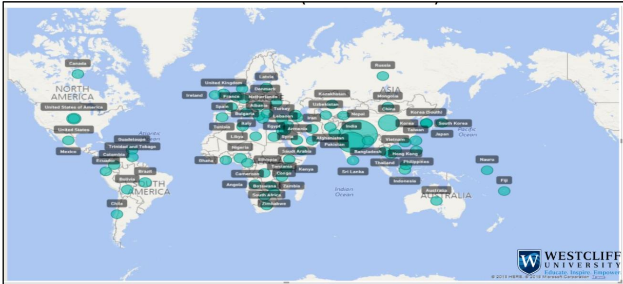
Figure 1: Countries Represented by Westcliff University's Students