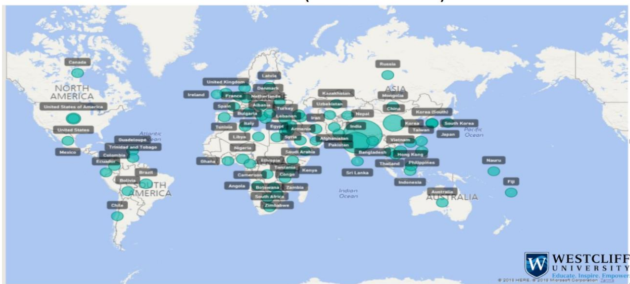
Chart 1: Countries Represented by Westcliff University’s Students

Westcliff University’s student population comes from more than 90 countries around the world (Chart 1). The institution ensures that students from underrepresented groups including female students, students from low income countries, and minority students have access to its quality education. Students, regardless of their background, have equal opportunity to obtain an education at Westcliff University. The University does not unlawfully discriminate in its admissions or educational policies on the basis of race, age, color, religion, disability, sexual orientation, gender, or national and ethnic origin. The University has different scholarships and award programs that assist incoming students in low incomes countries, females students, minorities students, etc. (For a list of scholarships and awards, please see Appendix 1).