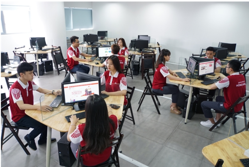
Students have practical lessons at Hồng Bàng International University in HCM City.