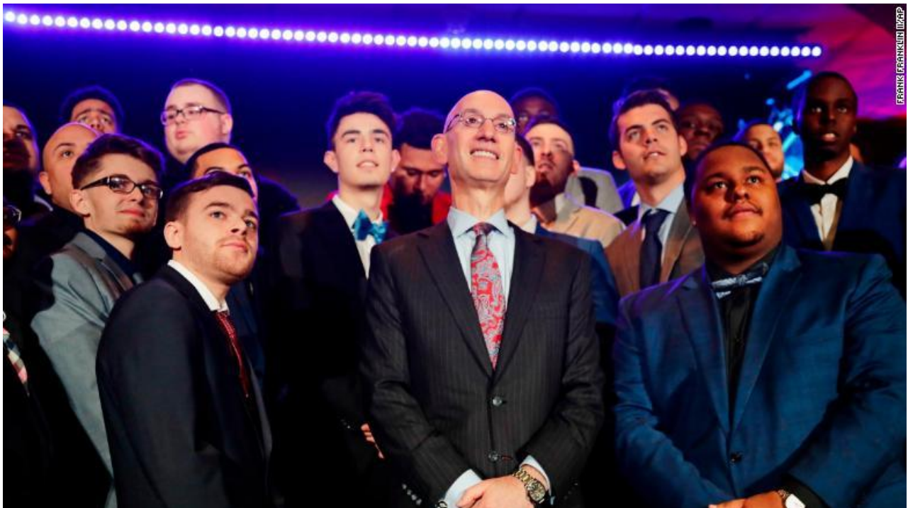
NBA Commissioner Adam Silver, center, poses for photographs with gamers at the NBA 2K League draft in April, 2018.

As hard as it may be to imagine for devotees of traditional sports leagues like the NFL or the NBA; eSports, at its highest levels, functions in a similar way. In fact, this April, the NBA held a draft for the launch of its new eSports league centered around the basketball-themed NBA 2K game franchise. During the draft, 102 professional eSports players were selected, with all of the pomp and circumstance normally reserved for players on the court.