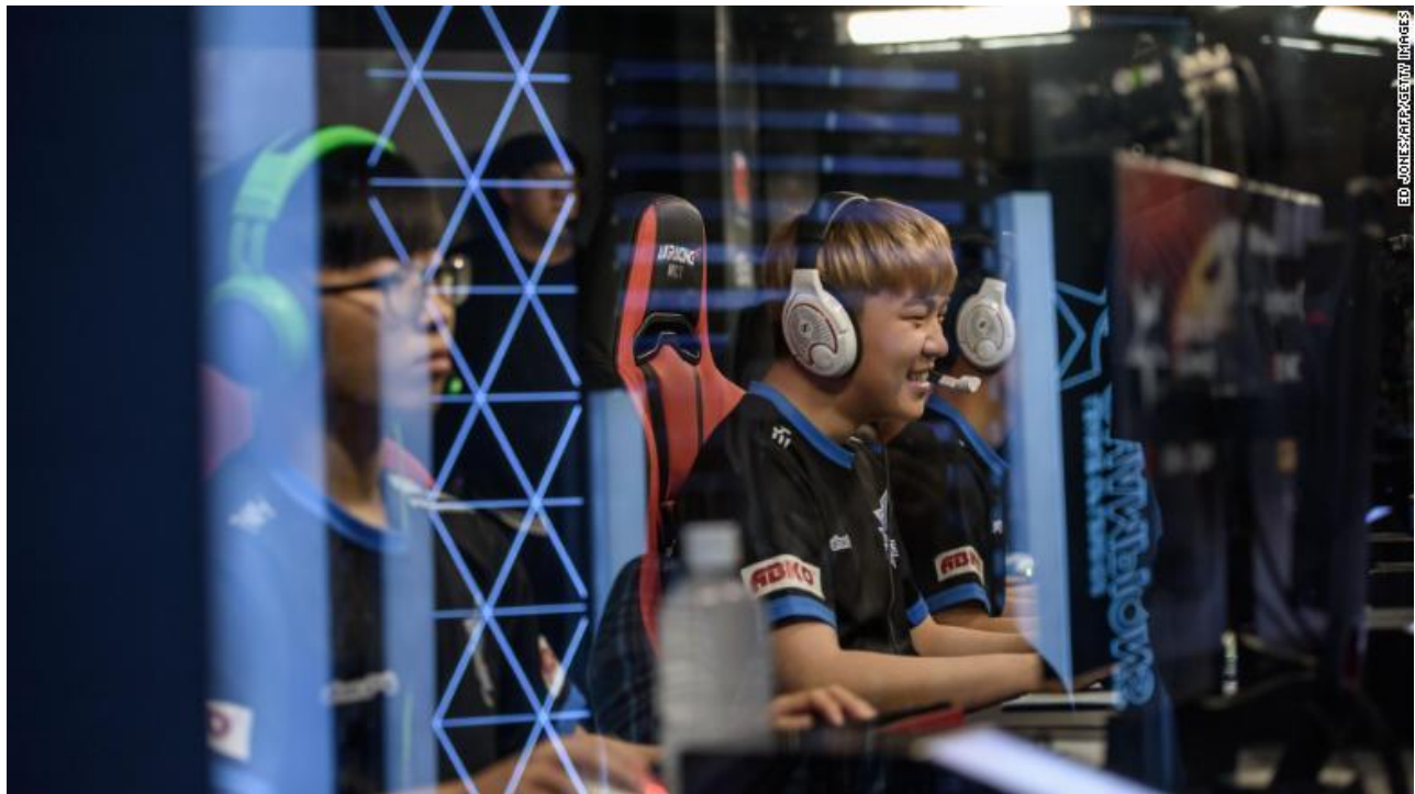
Members of professional eSports team 'Afreeca Freaks' prepare to compete in a 2018 'League of Legends' competition in Seoul.

After the shooting, EA Sports canceled the three remaining Madden Classic qualifier events to review safety protocols for competitors and spectators, according to a release issued by the gaming company.