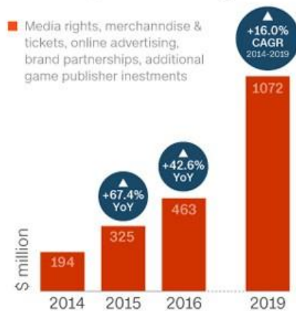
Global Esports revenue growth