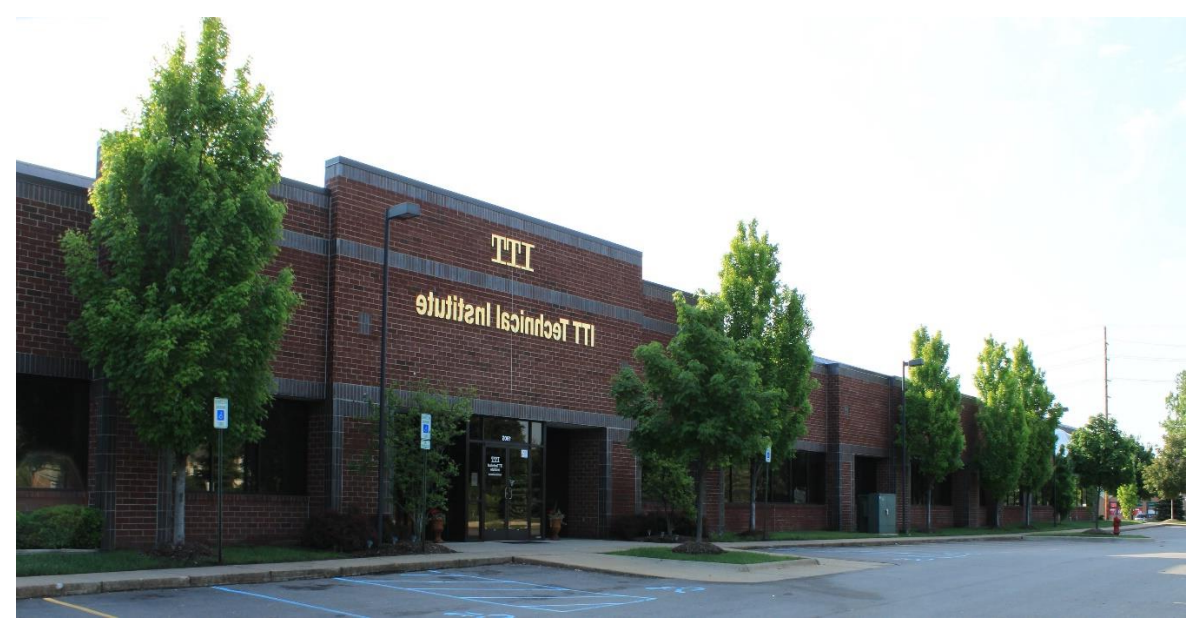
ITT closed more than 100 campuses in September 2016.

More than 100 for-profit and career colleges closed between the 2016-17 and 2017-18 academic years alone, while 20 nonprofit colleges shuttered during that period, according to <u>data from the National Center for Education Statistics</u>. And although the number of credentials issued increased 1.2% from 2012-13 to 2016-17, for-profits offered nearly 30% fewer than nonprofits.